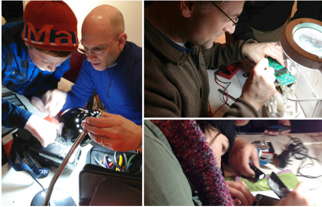
Figure 1: Repairs underway at the Fixers' Collective NYC, March 2015

systems of valuation – including socially coded relations of expertise and sometimes gender – that may also mark and inflect these spaces. Our fieldwork highlights how these processes serve to legitimate certain aesthetics and practices of repair while limiting or undermining others, in ways that both expand and limit the reach and impact of repair practice in such settings.